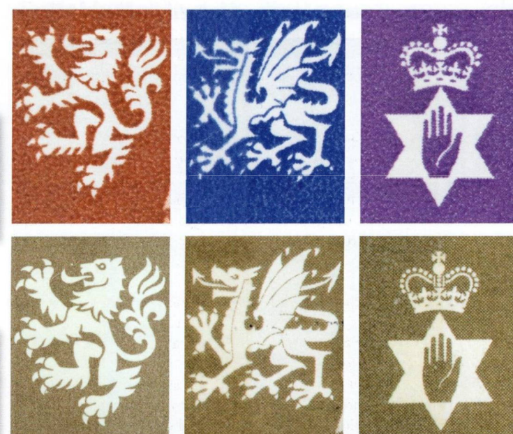
Regional definitives 1971 The Regional stamps used heraldic devices that required repositioning and resizing of the Machin head. This was the first time Jeffery had used heraldry in stamp designs, creating white-painted devices on a mid-grey ground. This ongoing series proved complex, and this article is not the place to produce a catalogue of all the variations, but the four basic evolutionary stages are recorded in the table shown below. (Note that some changes cross-over, as new printings were often released as-and-when needed.)